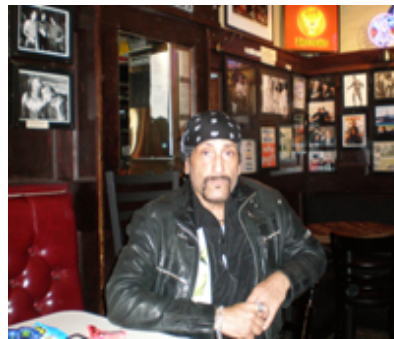
Manitoba's Bar is at 99 Avenue B (bet. 6th & 7th Sts.) (212) 982-2511 His radio show is on Sirius XM Radio weekdays from 8pm till midnight.