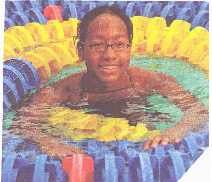
From July '09 SPORTS ILLUSTRATED