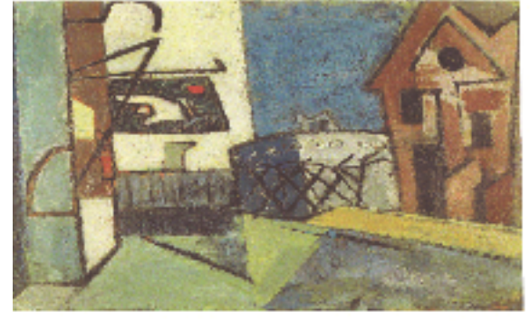
Avenue B, 1937