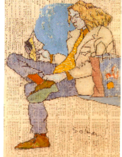
Yuppie On Subway, 1971